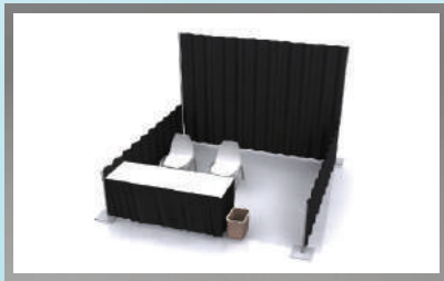
5' x 10' Turn-Key